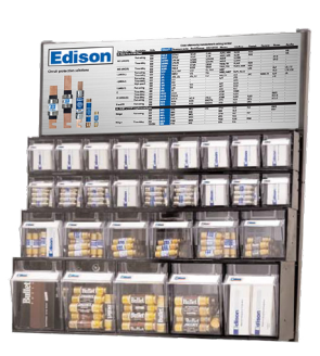
MKE-3 Product sold separately

With a merchandise display in your counter area, you establish yourself as the destination for Edison™ fuses in your local market.