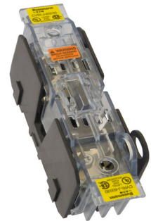
Optional covers provide IP20 finger-safe protection and lockout/tagout capability.