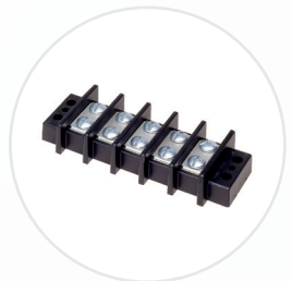
Panel-mount terminal blocks