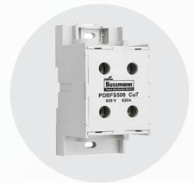
Power distribution blocks