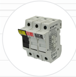
Panel-mount fuse holders