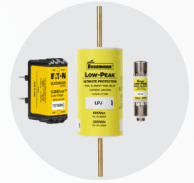
Fusible circuit protection

Bussmann series solutions offer industry-leading protection of electrical and electronic system components within control panels, and deliver increased protection of critical components. Trust our more than 100-year legacy of compact, safe and compliant circuit protection solutions.