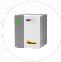
Surge protective devices