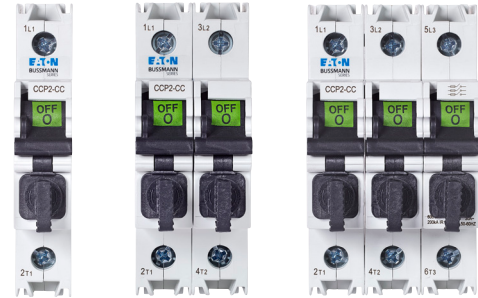
1-, 2-, and 3-pole CCP2-30CC

See CCP2-CC data sheet no. 10789 for complete technical information.