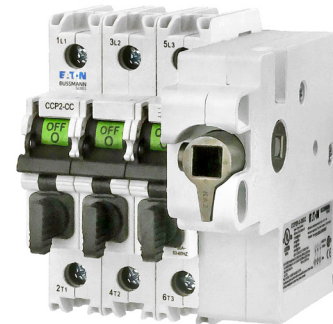
3-pole CCP shown with right front through-the-door rotary operator (CCP2R-3-30CC).