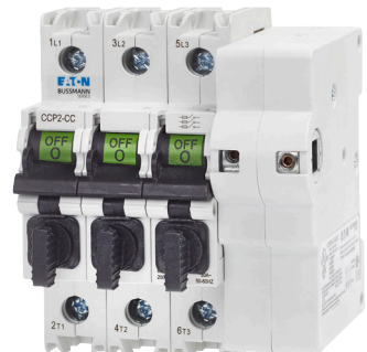
3-pole CCP shown with right side through-the-door rotary operator (CCP2S-3-30CC).