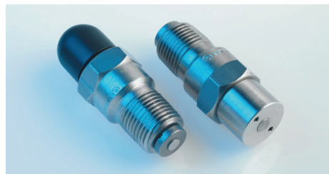
ECD NEMA 4X