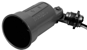
TP7162 - TP7165

DIE CAST ALUMINUM CONSTRUCTION, UP TO 150 WATTS, WITH LAMP GASKET, UL LISTED