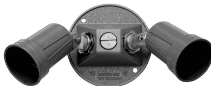
TP7330 - TP7332

DIE CAST ALUMINUM CONSTRUCTION, WITH GASKETS, UL LISTED