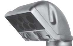
2 1/2" to 4" size