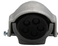
3/4" to 2" size