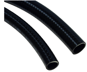
LTCOND38NMBL100 - BLACK