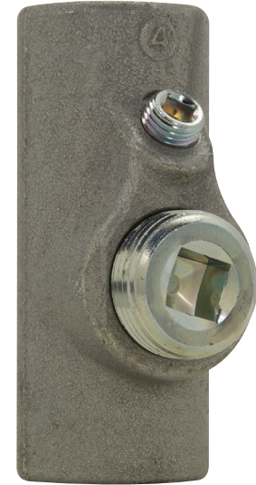
Vertical or horizontal female