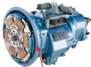
Eaton's first-generation UltraShift transmission used a centrifugal clutch to "float shift" by RPM.

Clutch systems for the top-of-the-line Eaton automated transmissions offer the durability and performance necessary to withstand the high actuation conditions associated with automated transmission systems.