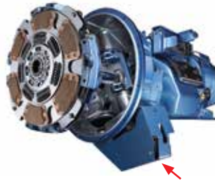
The Electronic Clutch Actuator (ECA) in Eaton's latest generation of automated transmissions – the UltraShift PLUS – "actively shifts" based on load, grade and throttle power. Complete shifts are smooth and quick.