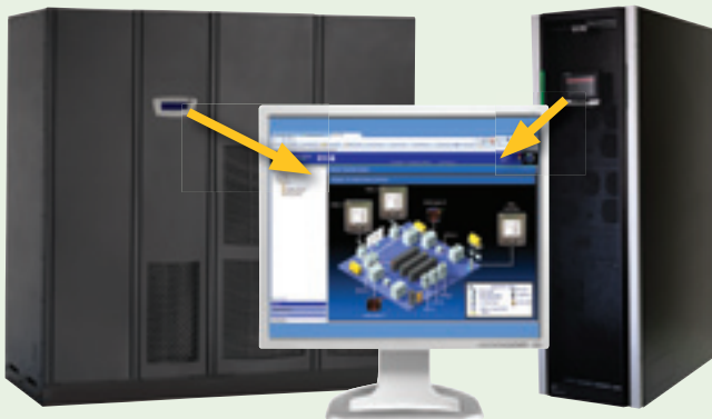
Eaton 9395 UPS