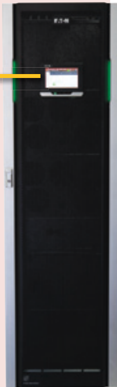
Eaton 93PM UPS

Benefit: The Eaton 93PM UPS offers a low cost of ownership through efficiency, reliability and ease of deployment.