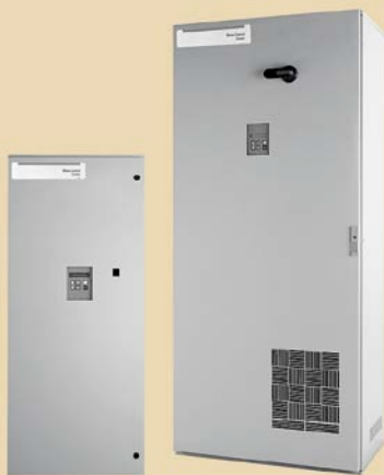
Harmonic Correction Unit