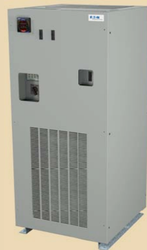
Electronic Voltage Regulator and Power-Sure 700