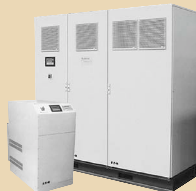
Sag Ride-Through (SRT2)