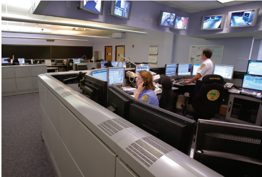
An elevated supervisor's bridge allows for clean sight lines across the entire Police Communications Center.