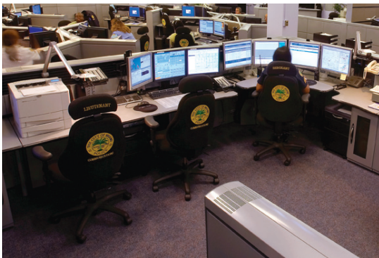
Eaton offers a broad range of ergonomic seating options for 24/7 continuous shift environments. The City of Miami customized their chairs with an embroidered logo.

To contact an Eaton salesperson or local distributor, please visit www.eaton.com/wrightline or call 800-225-7348