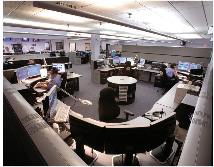
Profile's unique stackable core design allowed the City of Miami to utilize 77" high walls to separate various departmental disciplines.