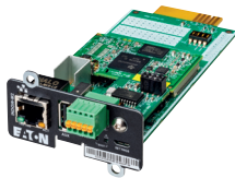
Industrial Gateway Card (INDGW-M2)