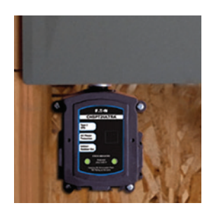
Easy. Installation is simple and is compatible with any manufacturers breaker box.