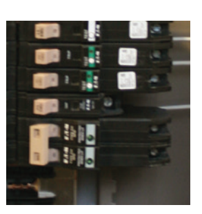
Flexibility. Surge protection plus a functional 2 pole circuit breaker.