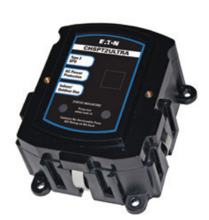
Complete Home Surge Protector (Externally mounted to your breaker box)