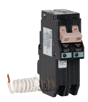
Complete Home Surge Circuit Breaker (Internally mounted to your breaker box)