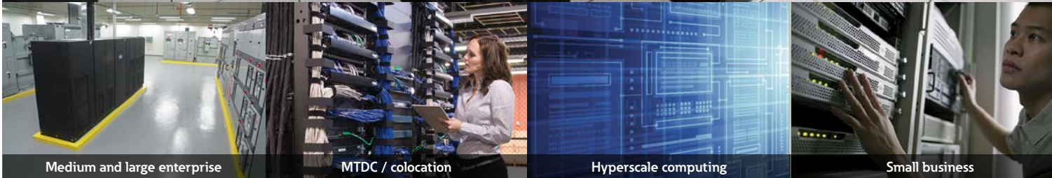
Medium and large enterprise