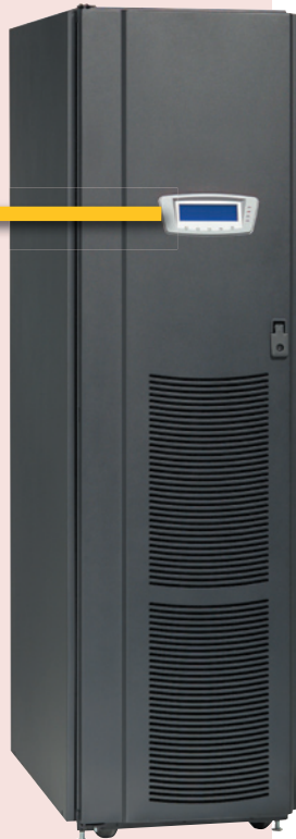
Eaton 9390 UPS

Benefit: Eaton® Series 9 UPSs protect against all nine power problems and deliver differentiated power quality solutions and a low total cost of ownership.