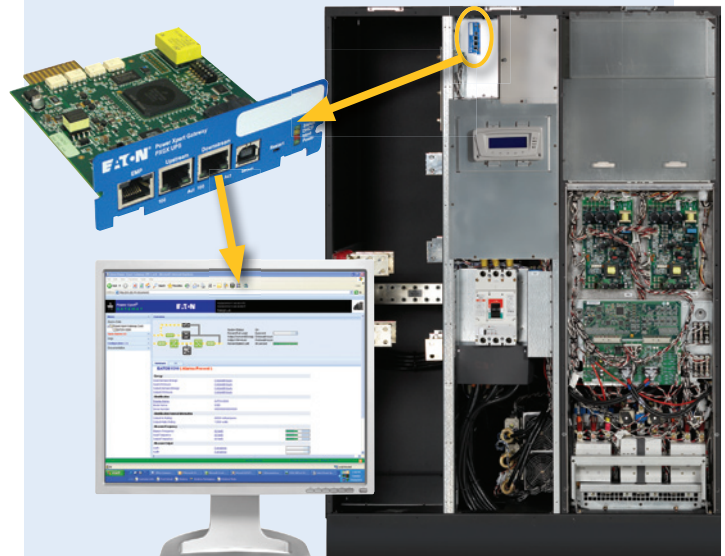
Eaton 9395 550 kVA