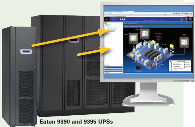
Eaton 9390 and 9395 UPSs