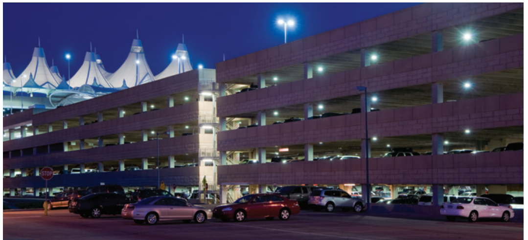
At the Denver Airport, Eaton lighting equipment ensures the parking facilities are illuminated and safe at all times.

For more information on Eaton's lighting solutions, visit Eaton.com/Lighting