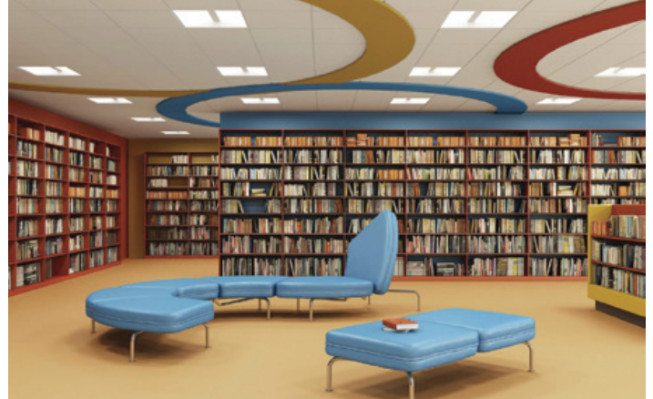
Eaton LED light fixtures and UPS solutions work together in libraries and other public spaces to keep patrons safe.

We also offer a full lighting portfolio, delivering a range of innovative and reliable indoor and outdoor lighting and controls solutions specifically designed to maximize performance, energy efficiency and cost savings. Eaton's Lighting Division successfully serves customers in the commercial, industrial, retail, institutional, residential and utility—as well as many other—markets around the world.