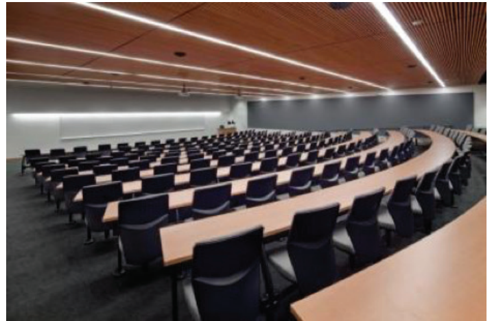
Eaton lighting fixtures illuminate the Business Leadership Building at the University of North Texas.

Eaton can provide a full range of UL 924-listed options for your backup power protection and emergency lighting needs. In addition to centralized systems, we also offer dedicated LED emergency lights, retrofitable LED and fluorescent emergency battery packs and a complete package of exit signs for commercial, industrial or architectural applications. Enjoy the peace of mind provided by the industry leader in the emergency space.