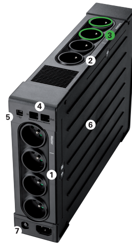
Eaton Ellipse PRO 1600