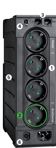
Eaton Ellipse PRO 650