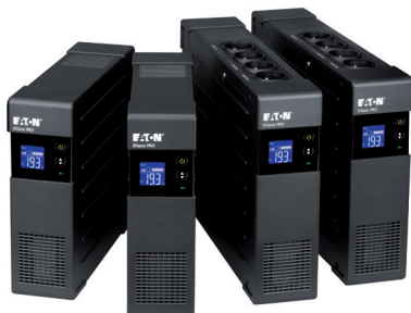
Ellipse Pro range