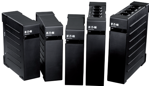
Eaton Ellipse ECO range