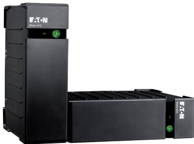
Eaton Ellipse ECO easy integration