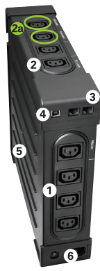
Eaton Ellipse ECO 1200/1600