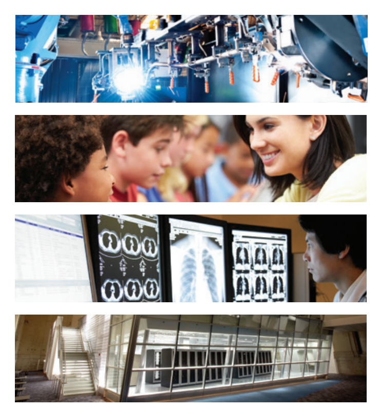
The 9PX can withstand harsh electrical environments, but still works in a variety of applications—industrial automation, K-12, healthcare, IT and more

Products need to work anywhere. The 9PX's rack or tower form factor makes it adaptable to your environment. (The LCD interface, surrounding bezel and logo even rotate to match your installation.) RT models are available in multiple voltage and wattage variations to meet your needs and include a four-post rail kit.