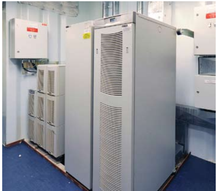
On board Oasis of the Seas, Eaton's UPS System protect critical applications against disruptive power interruptions.

Eaton's power protection solutions are employed in five of the Royal Caribbean International cruise line's Voyager-class ships (completed in 1999–2002), three of its Freedom-class ships (completed in 2006–2008) and in both of its Oasis-class ships. Oasis of the Seas' sister ship, Allure of the Seas, is due to be completed in late 2010.