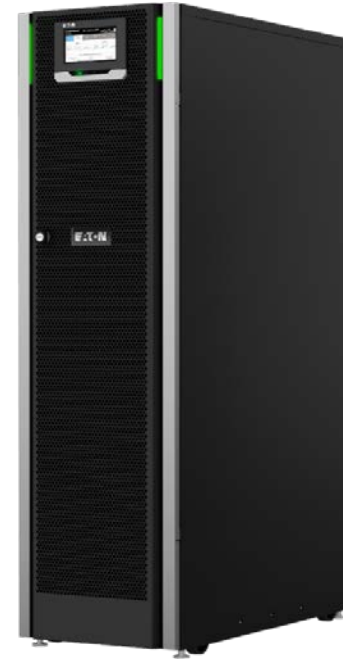
15/20 kW frame