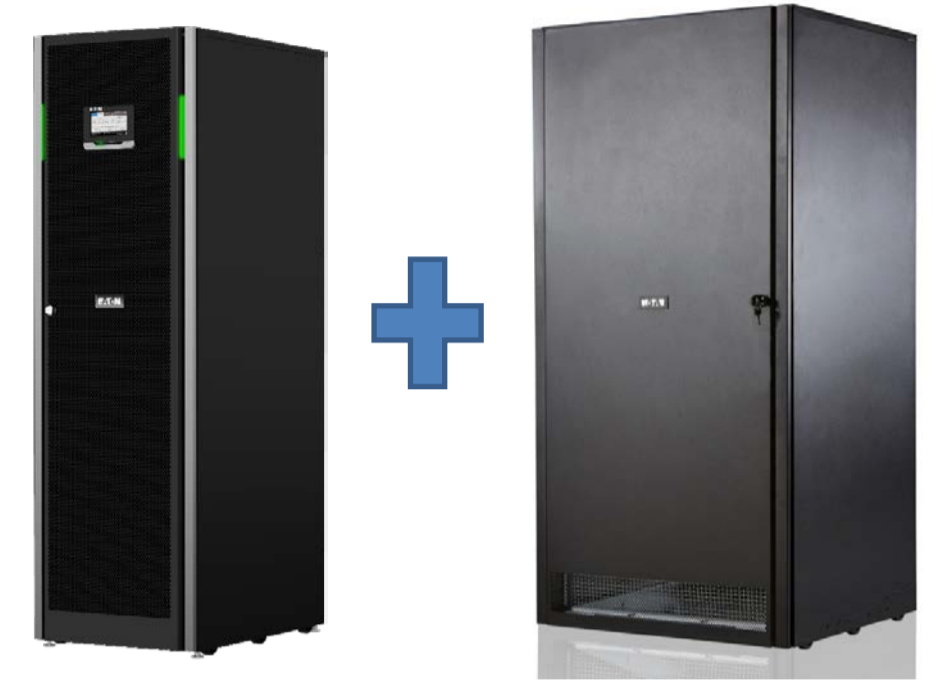
30/40 kW frame 3-4 strings of batteries

The batteries are fully charged and measured after min. (5) full discharge cycles.