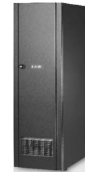
EBC-H 2 strings of batteries /