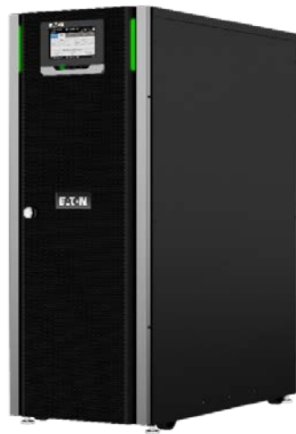
10 kW frame