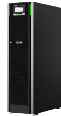
15/20 kW frame 0-2 strings of batteries