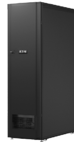
EBC-A 2-3 strings of batteries / cabinet