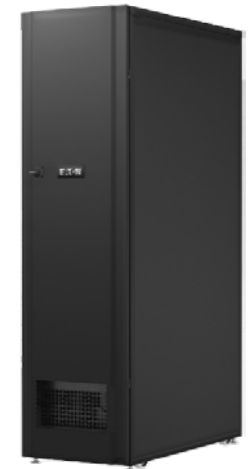
EBC-A 2-3 strings of batteries / cabinet