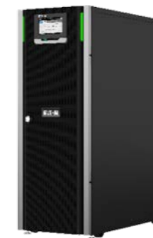
10 kW frame 0-1 strings of batteries