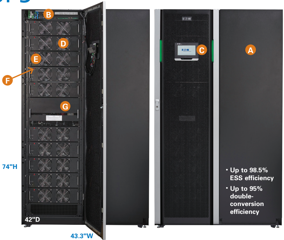
Open front view of the unit