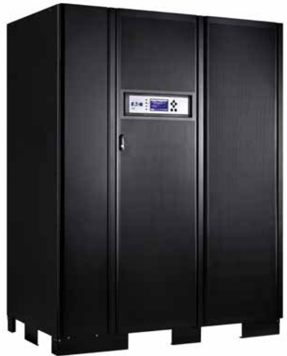
93E 15-400 kVA