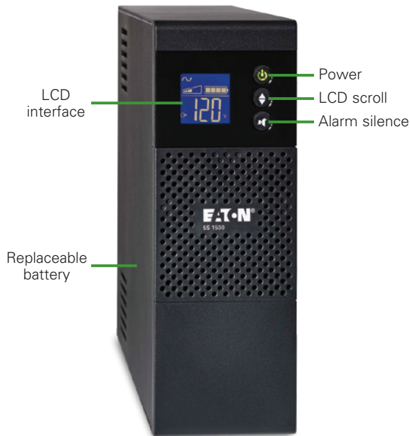
Model displayed above: 5S1500LCD