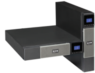
Eaton 5PX UPS