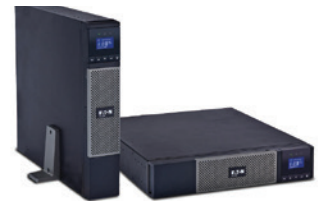
Eaton 5PX UPS

Learn how the Eaton 5PX can help you at Eaton.com/5PX .