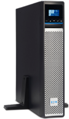
Tower: 1000–3000 VA