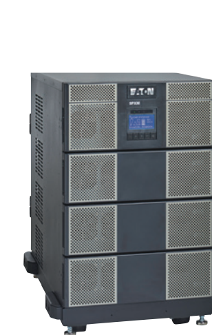
8-slot cabinet is scalable to 16 kVA in a 14U cabinet