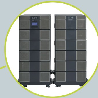
Smart EBM technology identifies batteries automatically