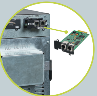
2 mini-slot ports for options using Network-M2 gives access to Eaton's software offerings