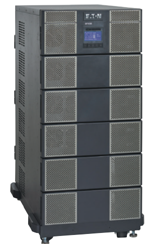
12-slot cabinet is scalable to 20 kVA (N + 1) in a 21U cabinet