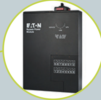
Protect against downtime during equipment maintenance with an external bypass power module