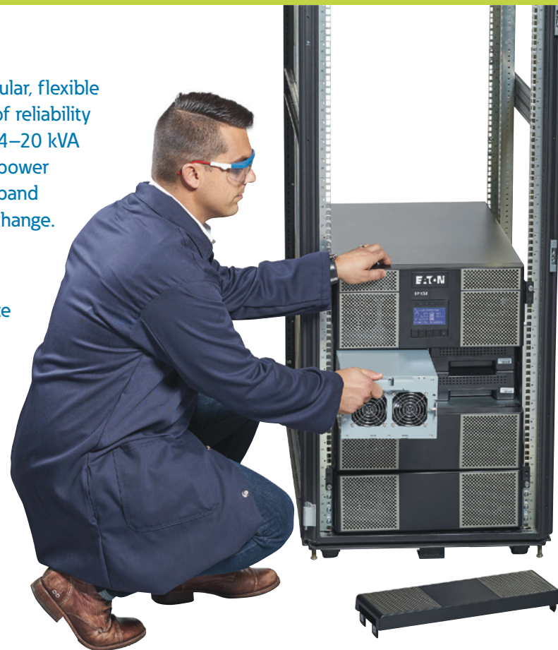
Easy hot-swappable power and battery modules

The plug-and-play power and battery modules are user replaceable so you can add them as needed without a service call or having to put a redundant system in bypass. With its low initial investment, online double-conversion technology, Eaton ABM® technology and high efficiency mode, you never have to compromise reliability for efficiency.