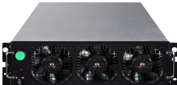
The 93PR 25kW UPM (Uninterruptible Power Module)

The 93PR still offers the highest double conversion efficiency in the market, reaching above 96%.