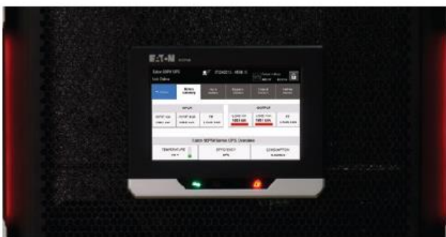
Red light bars showing alerts on system. Yellow light bars indicate battery and bypass status.