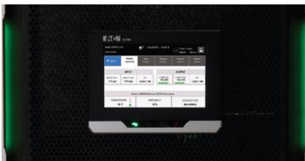
Green light bars showing healthy UPS.