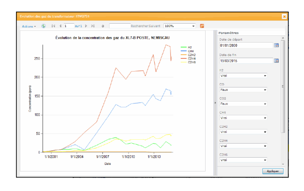
Figure 4: Sample dissolved gas concentration trending view[7]