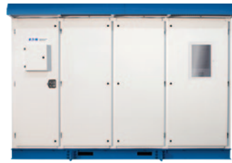
Utility scale energy storage inverters—500 kW through 2000 kW