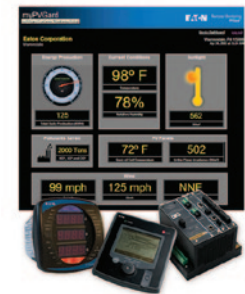
Meters and software