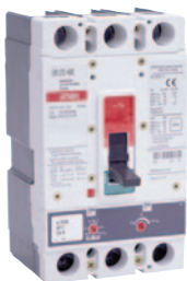
AC circuit breakers