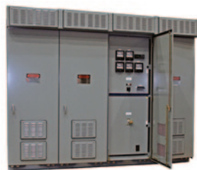
Medium voltage AC switchgear