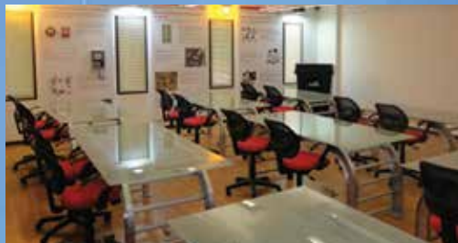
Dammam, Saudi Arabia