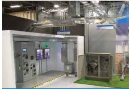
Industrial and commercial applications