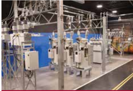
Utility substation and distribution

Interactive demonstrations, including the green automatic transfer switch, illustrate modern protection and backup systems for residential applications.