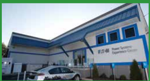
Pittsburgh, Pennsylvania, USA