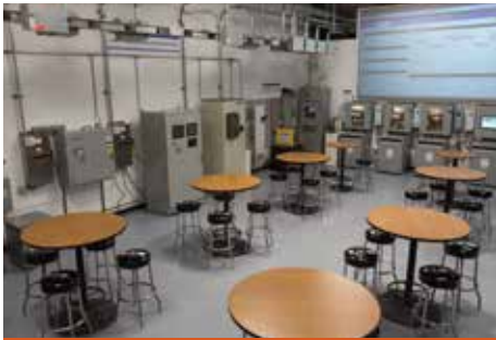
Power quality lab