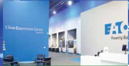
Houston, Texas, USA