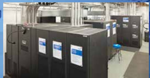
Raleigh, North Carolina, USA