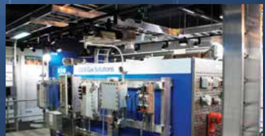
Seoul, South Korea

Eaton created first-of-its-kind Experience Centers around the world that offer global education solutions with the unique ability to enable customers with hands-on training in multiple application environments.