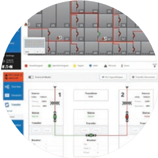
Low voltage switchgear elevation and one line view