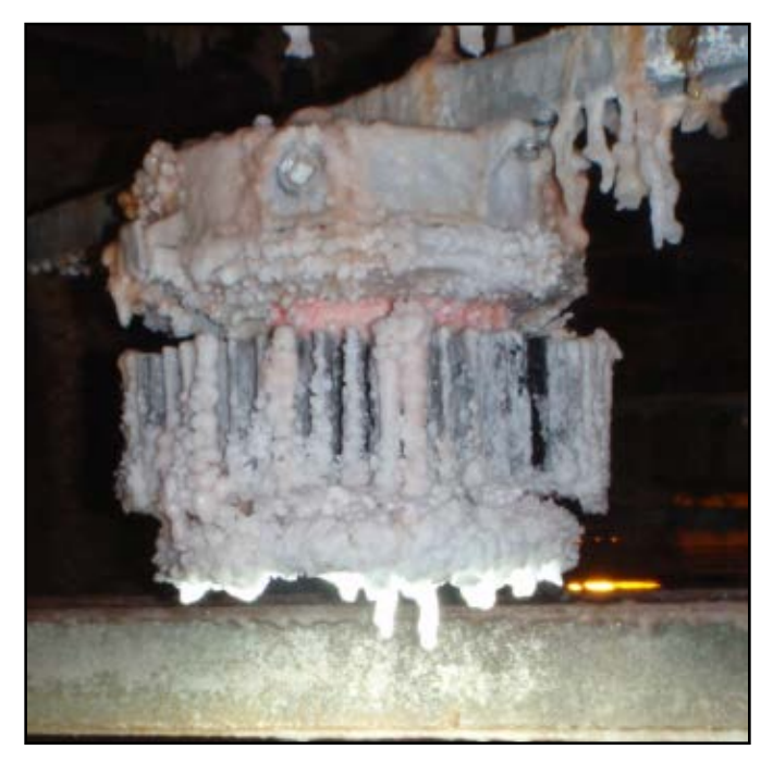
Fig. 2: LED light fixture installed in potash mine

LED light fixtures are commercially available that have an ingress protection level of IP66 which is zero foreign object ingress, and zero water ingress from powerful water jets. A light fixture that has an ingress protection rating lower than IP66 does not have the same performance characteristics. Robust light fixture construction that prevents failures in areas of flying debris, high pressure wash down areas is critical to safety and performance. Fig. 2 and Fig. 3 show examples of harsh industrial applications for LEDs.