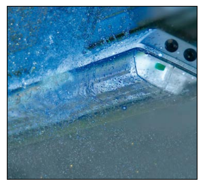
Fig. 3: LED light fixture installed in high pressure wash