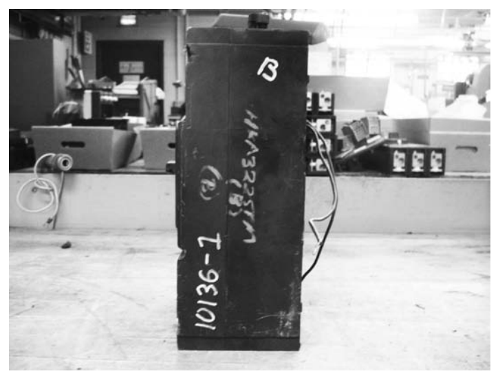
Figure 9. Wires Welded to Terminals After Excess Current Traveled to the Ground