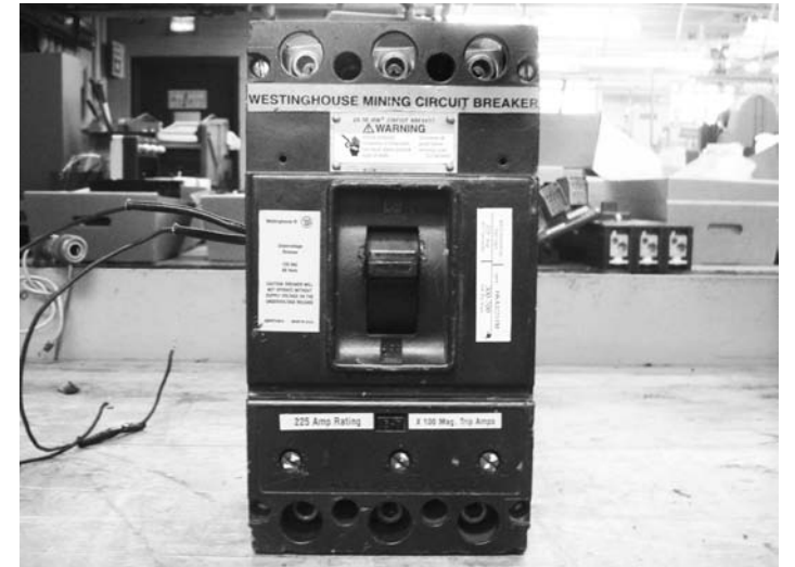
Figure 10. Third-Party Refurbished Breaker After Failing Load Endurance Test