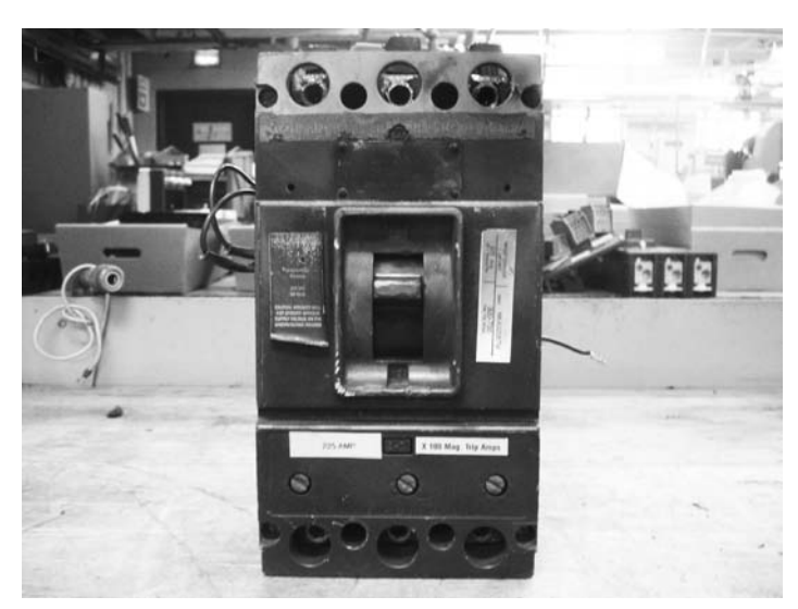
Figure 8. Third-Party Refurbished Breaker Failed to Interrupt on Short-Circuit Test

The unit was believed to be an HKA; the sample was tested for endurance based on Eaton's published data for the HKA frame. The third-party sample passed initial calibration, but failed the endurance test when the ground fuse opened during the load operations at the rated current. After the ground fuse opened, the center pole of the breaker did not have continuity when closed. Figure 10 and Figure 11 depict the third-party breaker after testing.