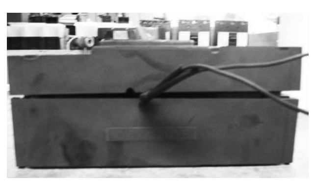
Figure 2. Breaker Cover Separated from Base During High Fault Test