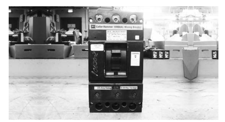
Figure 18. Eaton Production Breaker Shown After Testing; it Passed the Entire Test Sequence with No Issues