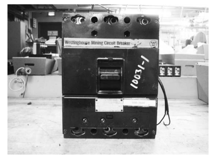
Figure 12. Third-Party Refurbished Mining Breaker with Limited Nameplate Information

In this test, the third-party unit appeared similar to Eaton's LAM circuit breaker, but the nameplate had limited information. It was tested in accordance with the calibration test procedures. The third-party breaker tripped below the maximum time limits in 200% single-pole and 135% three-pole initial calibration tests and passed the overload portion, but it failed to remain closed during the temperature rise test at 100% of rated current. The breaker tripped before its temperature stabilized. The results indicated that the thermal release on the third-party sample was not properly calibrated; the error was likely to result in nuisance tripping. Eaton's production test procedures require trip units to be calibrated so that breakers will not trip before temperatures are stabilized at 100% of the rated current in their designated ambient temperature. Figure 12 and Figure 13 are photographs of the failed refurbished breaker