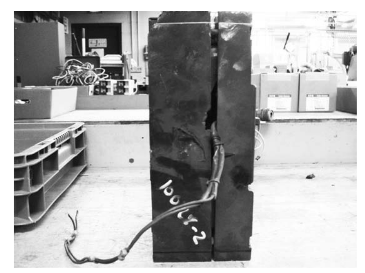
Figure 5. Post High Fault Test; Breaker with Cover Separate from Base