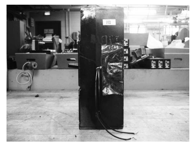
Figure 13. Breaker Did Not Stay Closed During Temperature Testing, Indicating Incorrect Calibration