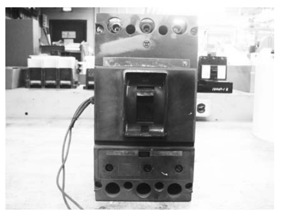
Figure 1. HKA Breaker Repaired by Third-Party Refurbisher, Following Testing

An HKA labeled third-party breaker was tested and compared to a new Eaton circuit breaker. The third-party breaker failed to trip on time in pre-test calibration, and then received its first high-level fault-interrupting test, which resulted in the center pole cable pulling out of the breaker, and the cover separating from the base (see Figure 1 and Figure 2 ). The test breaker failed to interrupt the fault in time, so the laboratory backup breaker had to clear the circuit. The refurbished breaker was unable to attempt a second interruption. Eaton's new breaker received both high-current faults and is in notably better condition post-interruption ( Figure 3 ) than the sample third-party modified breaker, pictured in Figure 1 and Figure 2 .