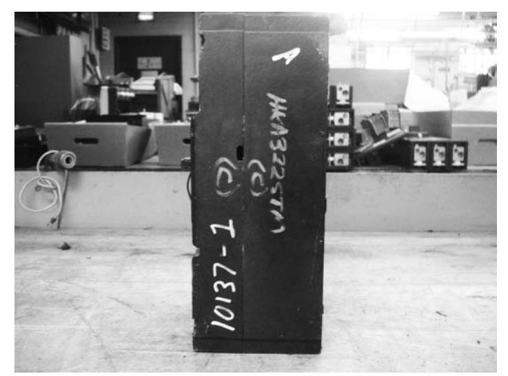
Figure 11. After Failure, Breaker Lost Continuity in the Center \ensuremath{\mathsf{Pole}}