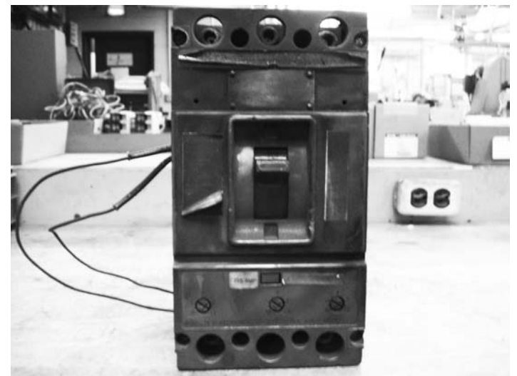
Figure 6. Third-Party Refurbished Breaker Shown Post-Testing; No Nameplate Provided