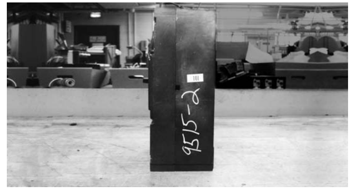
Figure 15. Undervoltage Release Accessory Malfunctioned; Breaker Could Not be Reclosed