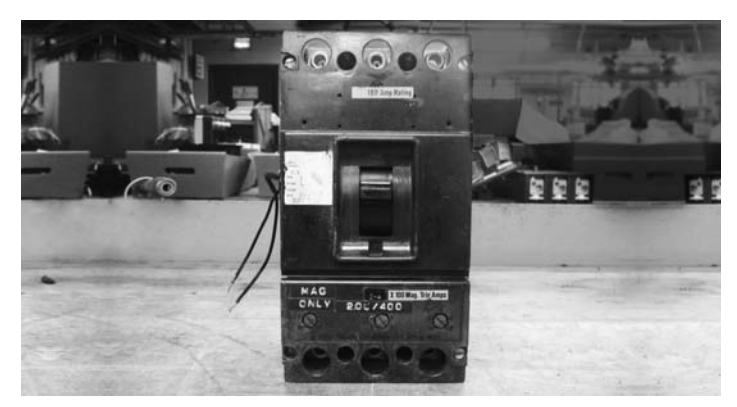
Figure 14. HKAM Mining Breaker Modified by Third-Party Refurbisher

A sample third-party modified HKAM breaker was subject to the endurance testing and compared to an Eaton HKAM circuit breaker from current production. The third-party refurbished breaker had a malfunctioning undervoltage release (UVR) that would not stay engaged with the full rated 120V applied to it. Consequently, it would not remain latched and the breaker could not be closed; Figure 14 and Figure 15 are photographs of the third-party breaker after testing. In contrast, the Eaton newly manufactured breaker passed every portion of the testing procedure, which includes pre-calibration, and dielectric withstand. Figure 16 is an image of the Eaton production breaker after testing. Eaton tests the pickup and dropout voltage of each UVR to ensure that the accessory functions properly when installed in the circuit breaker.