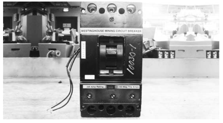
Figure 17. Third-Party Refurbished HKA Breaker with Poor Quality, Homemade Labels; the Breaker Failed to Trip on Overload Test

The third-party breaker had incomplete information on homemade labels. The sample was tested for low-level interruption and compared to a new Eaton HKAM circuit breaker from current production. The third-party breaker failed initial calibration, with one pole carrying 200% of rated current past the allowable trip time. The sample completed the short-circuit portion of the test and passed post-interruption dielectric withstand. Eaton's circuit breaker passed the sequence with no non-conformances. Figure 17 and Figure 18 are of the third-party and Eaton production units, respectively.