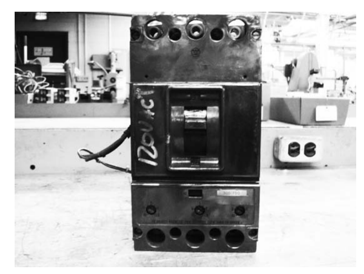
Figure 4. Third-Party Refurbished Breaker Without Nameplate or Product Identification

Another sample modified breaker, type HKA, was tested in the high interruption test at 480V, 60 Hz, with 35,000A available. The third-party sample failed the first high fault interruption test, with the base separating from the cover and the lab back-up breaker clearing the fault. The wires were pulled out of the left and center poles. The third-party sample is again in much worse condition than the new Eaton sample, even after the Eaton breaker endured a second fault interruption test. Figure 6 shows the third-party unit after testing, and Figure 7 shows that the A and C phase line conductors (on top) overheated and the material melted off.