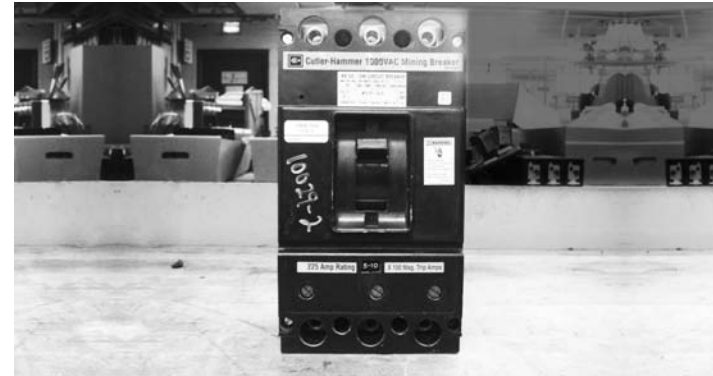
Figure 16. Eaton Manufactured Breaker; Undervoltage Release is Tested for Proper Operation