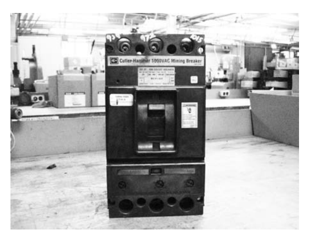
Figure 3. Eaton Manufactured Mining Breaker with Proper Identification and Labeling; Successfully Passed Testing Sequence