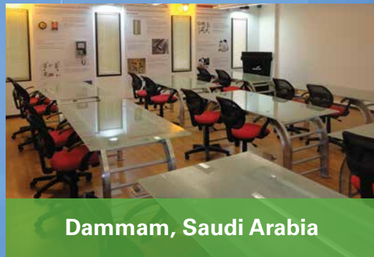
Dammam, Saudi Arabia

Eaton's Experience Centers provide a global education solution with the unique ability to enable customers with hands-on training in multiple application environments, Eaton created first-of-its-kind Experience Centers located across the globe.