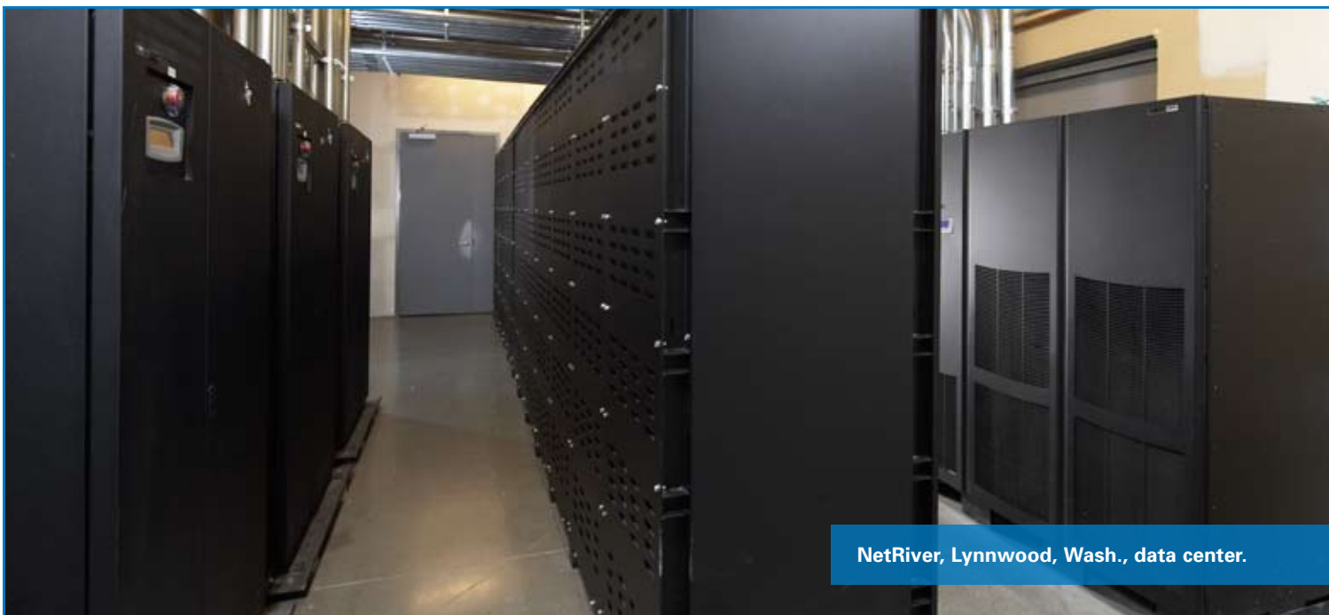
NetRiver, Lynnwood, Wash., data center.