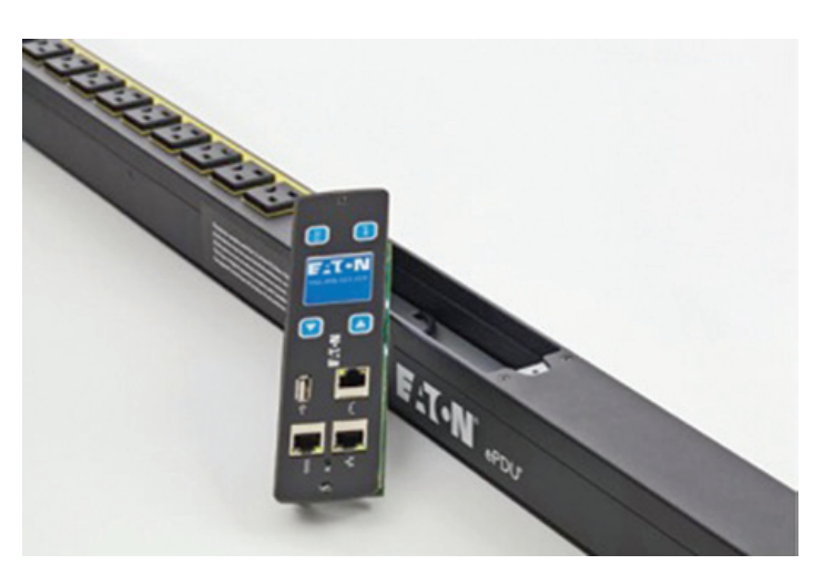
Figure 4. A hot-swap network meter card minimizes downtime on a rack PDU.

Another advantage to minimize disruptions is a hot-swap network meter card. A serviceable rack PDU can accommodate a hot-swap module complete with a meter display, network ports, LCD interface and CPU, all of which data center staff can replace without losing power to servers connected to the PDU. This facilitates field service intervention without the associated downtime. This serviceability concept is similar to hot-swap fans and power supplies found in rackmount servers that aim to prevent downtime.