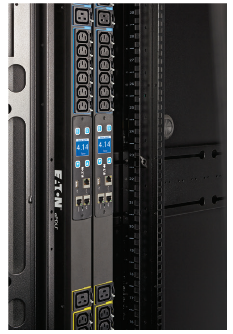
Figure 1. Rack PDUs with racks from the same vendor ensure compatibility, which enables agility in the data center.

With a wide range of customer requirements in a multi-tenant data center, agility is critical. The best way to facilitate agility? Make sure a vendor can provide both the rack and the PDU. Compatibility goes a long way to ensure ease of use and optimize the way the two components work together.