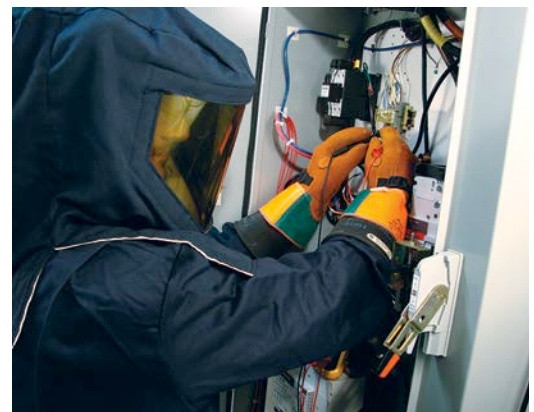
Worker wearing personal protective equipment (PPE)