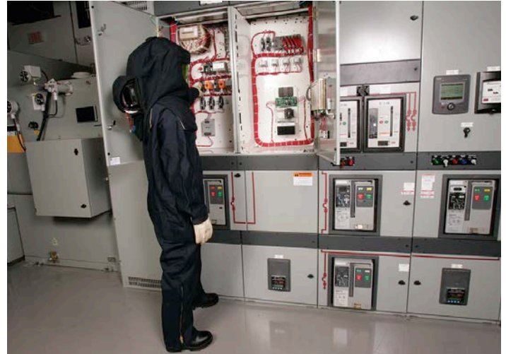
Worker wearing PPE inspecting low-voltage switchgear