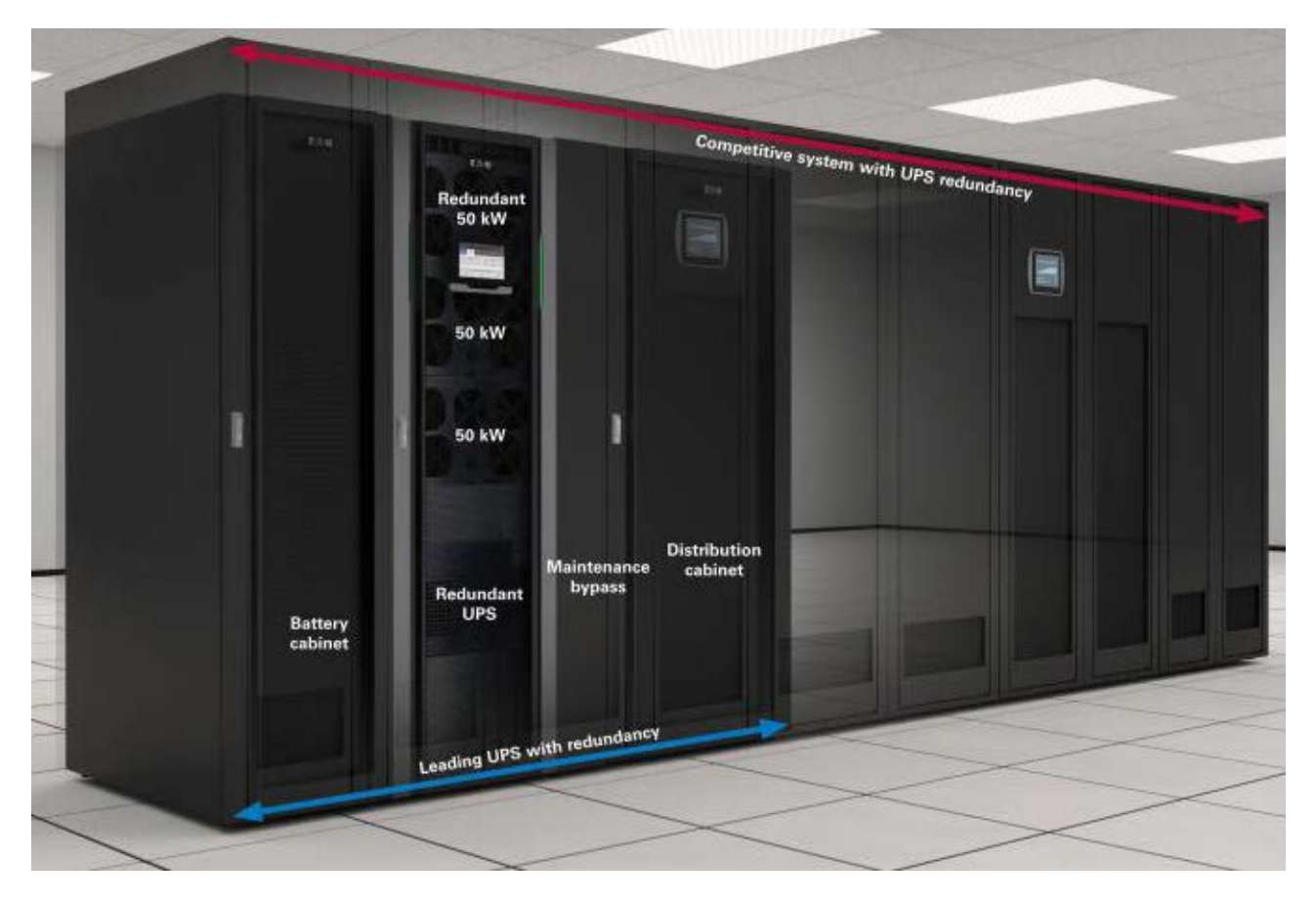
Figure 1. Modular UPSs save money and floor space by enabling data centers to "grow vertically" (reducing horizontal sprawl as shown above) and leverage internal redundancy, rather than install backup units.

Furthermore, some modular UPSs enhance reliability by providing internal redundancy. Should one power unit fail, the others around it can automatically take up the additional load. That enables cloud and colocation data centers to meet steep availability requirements without buying and maintaining expensive backup UPS hardware.