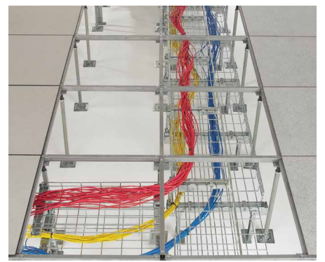
Cables installed in a raised floor

The most common type of cable support found in data centers is wire basket cable tray. Wire basket is sturdy enough to support large cable quantities, and its open structure provides adequate cable ventilation and does not block airflow. Per the ANSI/TIA/EIA-942 standard, cable tray should have a maximum depth of 150mm (6"). Deeper cable trays can adversely affect manageability and administration of cables. If more than 6" (150mm) of cable depth is required, trays should be installed in multiple layers to provide additional capacity. Since many data centers do not start at full capacity, cable tray systems are frequently designed to accommodate growth. Often the initial installation is a single layer, and further layers of cable tray are installed as the data center infrastructure grows. If the initial cables will not be accessed after installation, a complete cable tray structure may be installed over the initial structure. If regular access to the initial cables is required, a cantilever system should be installed. Designers should keep in mind that the NEC requires the removal of cables not currently in use and access to the base structures may be required. See ANSI/TIA-569-B for further cable tray design considerations.