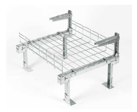
Self-supporting cable management system

The tray system should be flexible enough to be adjusted on site to avoid the many unforeseen obstructions under the raised floor such as chilled water pipe. As a rule of thumb, changes in the vertical height of the tray should be limited to a one inch change in vertical per one foot of horizontal.