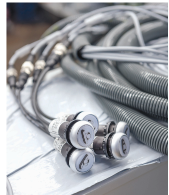
The ready-made illuminated pushbuttons meet requirements for greater time and cost efficiency, space-saving, and increased flexibility

Eaton EMEA Headquarters Route de la Longeraie 7 1110 Morges, Switzerland www.eaton.eu