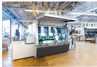
The four-side moulder for lateral working of timber beams and mouldings is capable of processing up to 600 m of wood per minute

The pushbutton is not just a customer-oriented solution but will also feature in Eaton's permanent RMQ compact solution portfolio. This range also includes a number of other compact and efficient solutions in the field of the RMQ Titan control and signalling device range, which is used in machine and plant building. This is because, above all, the solutions offer: the brightest button with the greatest flexibility and efficiency.