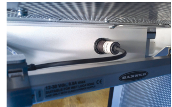
With protection class IP67/IP69K on the front panel and the sealed cable and protection class IP65 on the rear, the illuminated pushbutton is fully protected against dust