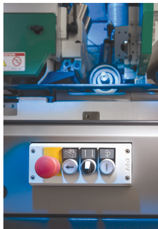
The end user can decide on the positions of the illuminated pushbuttons that are used to operate the jackscrews