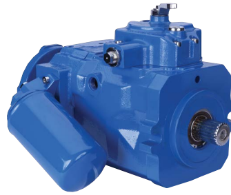
DuraForce HPV pump

"Through the strength of the DuraForce technology, we have helped Terramac and Motion Canada bring a higher quality crawler carrier to the oil and gas and mining markets."