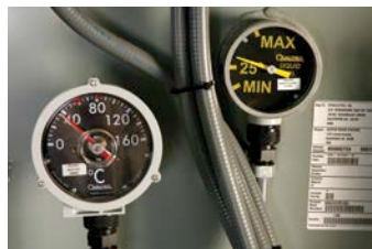
Temperature and liquid level gauges.

Eaton has performed extensive testing on the effects of transient voltages on similar design Cooper Power series liquid-filled transformers. The results have shown that these enhanced transformer designs are capable of withstanding harsh transient conditions without the need for RC Snubber circuits. Additionally, years of experience in high-reliability applications have led to refinements in enhanced performance designs. Those same design philosophies have now been expanded to our CLT transformer product offering. For more information on this topic, please refer to WP202001.