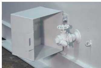
External, pad-lockable drain valve.

Whether it's life expectancy, overload capability or failure predictability, Envirotran CLT transformers outperform every time.