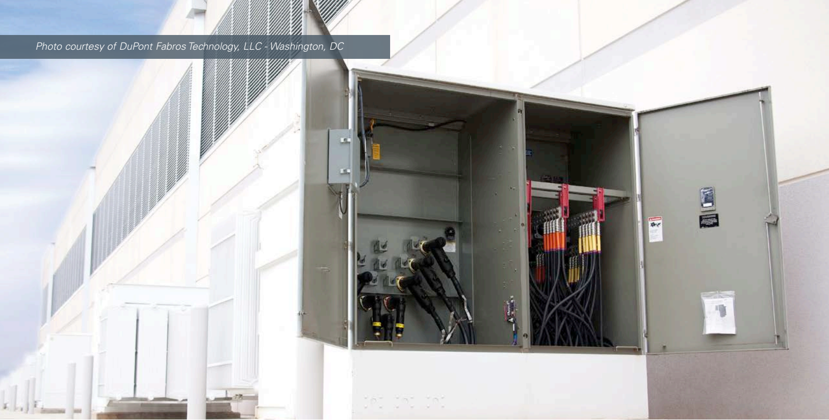
The top priority in critical applications is uninterrupted service. A pad-mounted Envirotran CLT with a tamper-resistant cabinet is ideal for outdoor applications.