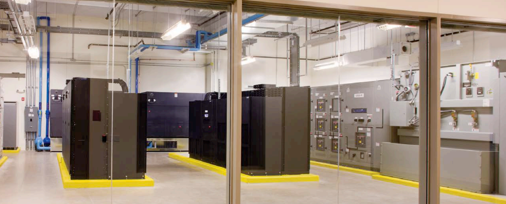
Envirotran liquid-filled transformers utilizing Envirotemp FR3 fluid, recognized by the National Electrical Code (NEC), UL, and FM Global, have been installed indoors in various applications for more than 15 years. Containment pan provides easy compliance with electrical codes.